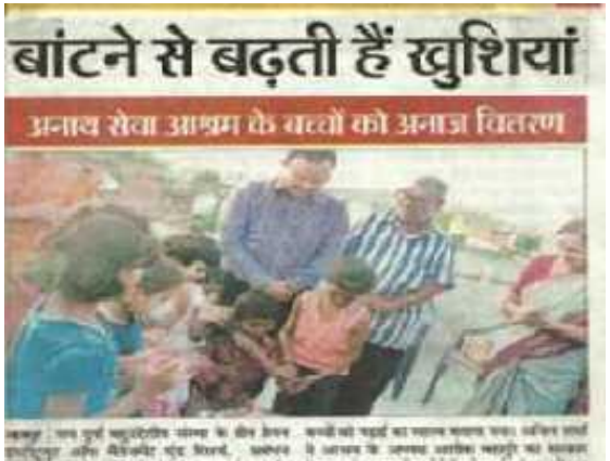
प्रारंभुग्धा स्तरि केरेकांट पुंच प्रेराज आकार के स्वातंभारत के सार्व, कार्यका स्वान्ध्य का तै . सिन स्वातं और सार्व्य के प्रारंभ स्वीन्दा स्वान्ध्य का प्रारंभ स्वान्ध्य के प्रारंभ स्वीन्दा स्वान्ध्य स्वान्ध रह को दिन किन्द्र प्रारंभ्य स्वान्ध्य की सार्व्य, भीन रह को दिन किन्द्र प्रारंभ्य स्वान्ध्य की सार्व्य, भीन स्वान्ध्य के अपनी स्वतित, स्वान्ध्या कि सार्व्य, भीन